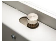
door security bolt