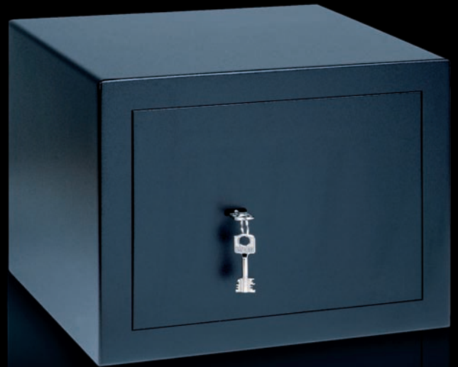
H 1 S