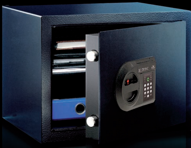
H 1 E