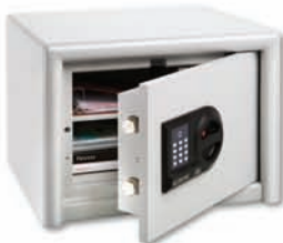
CL 20 E