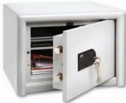
CL 20 S