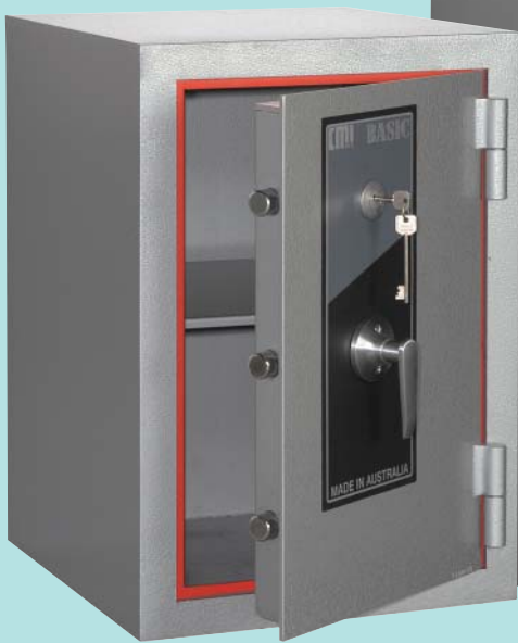
MODEL BASIC 1K