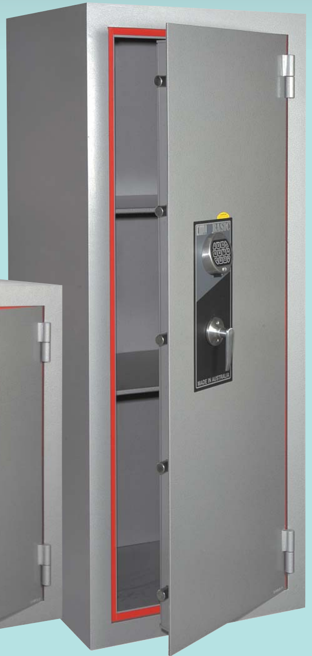
MODEL BASIC 3D