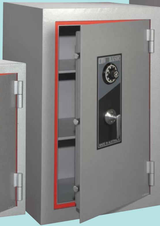
MODEL BASIC 2C